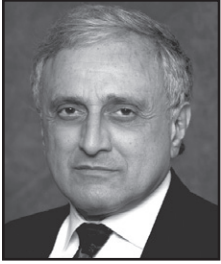
Carl P. Paladino