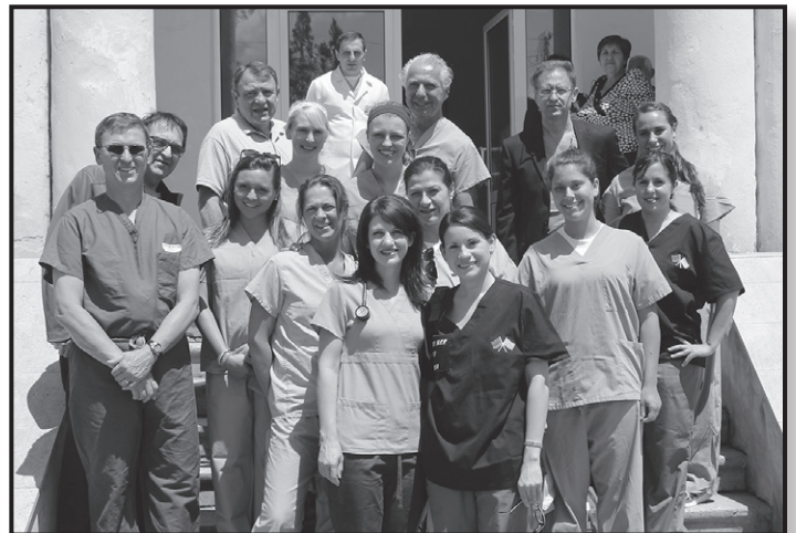
HFT volunteers in Armenia