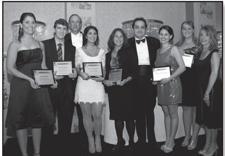
HFT Student Trip Volunteers along with HFT Board Members